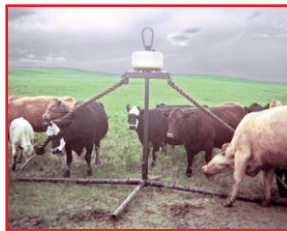
The cows are lined up to use the rope oiler.

The rope is user friendly to the animals, wraps around the animal maximizing coverage and the animals rub directly on the rope. The animals will rub the rope in the face area thereby maximizing fly control and reducing pinkeye.